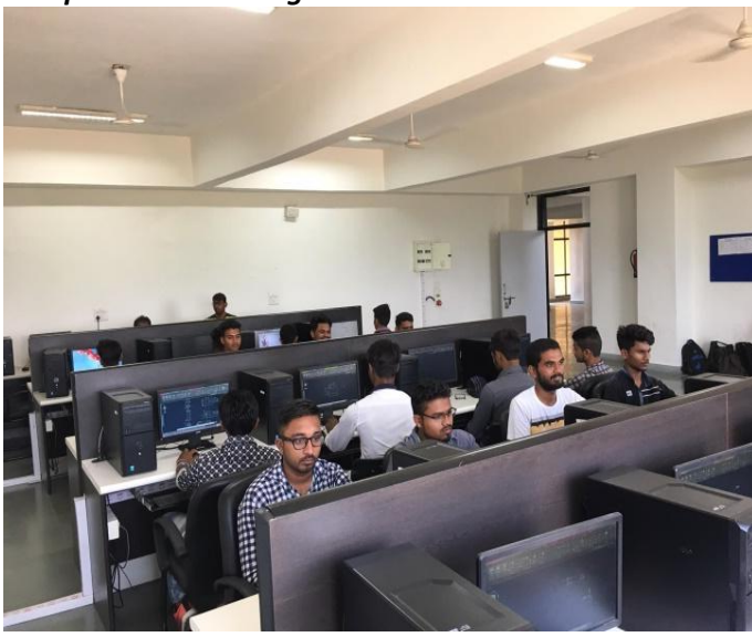
Machines and Mechanisms Lab