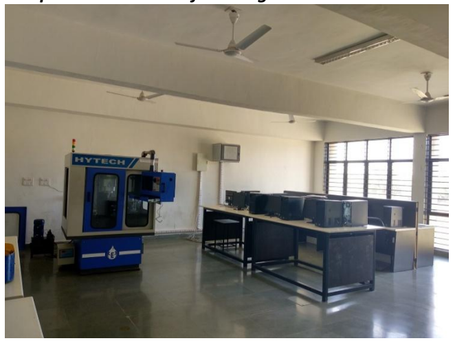
Heat and Mass Transfer Lab